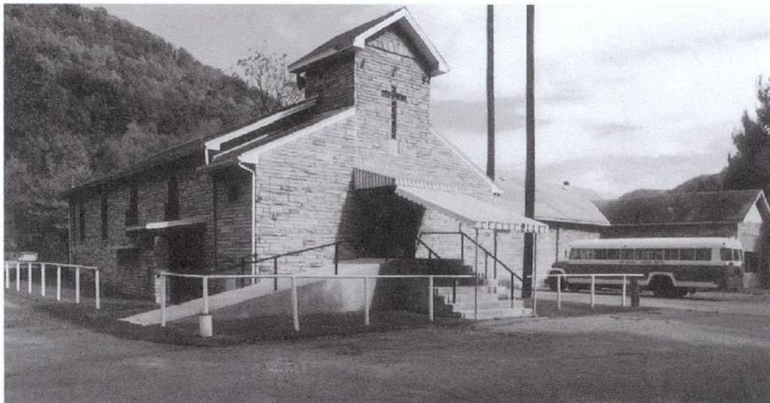
New Church (completed in 1954) Activity Building and Parsonage (to the right, were added later)